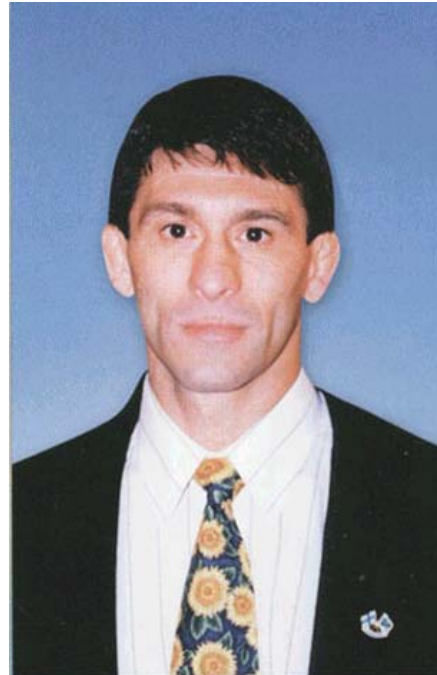
Valentin Jordanov had both a long and successful career. He won his first World Championship in 1983, and won an Olympic gold in Atlanta at 36.51 years old.