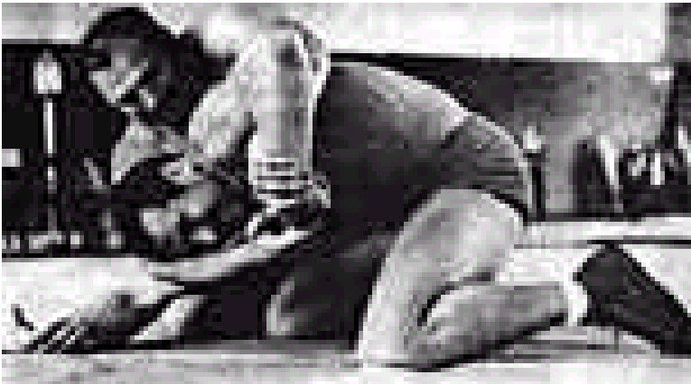
Anatoli Roschtschin is the second oldest Olympic wrestling champion, having won his last gold in 1972, at the age of 40.49 years old.